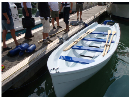
The prototype of the Trinity 500

Once the boat arrives at T.S.Echo we will trial it with the cadets, and our