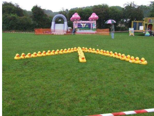
Corporate ducks line up in 2009!

Once again a lot of planning will be involved but we will try to better the previous years events and hope to have all of your support in 2010!