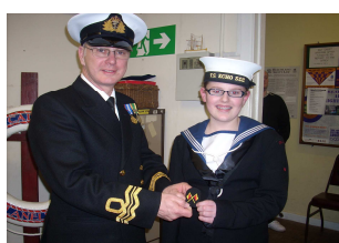
Unit Review 2008

As part of the process we have had our annual Health and Safety inspection to ensure that all is safe and well for the training of cadets. The ATTI—Authority to train inspection—will refresh our units authority to train cadets to a high