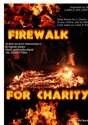
Poster for the Fire walk.

to get 30 participants interested, and then ask them to raise at least £100 entrance fee, and also collect sponsorship for a charity or charities of their choice.